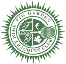
FIG GARDEN SWIM & RACQUET CLUB

4722 North Maroa • Fresno, California 93704-3207